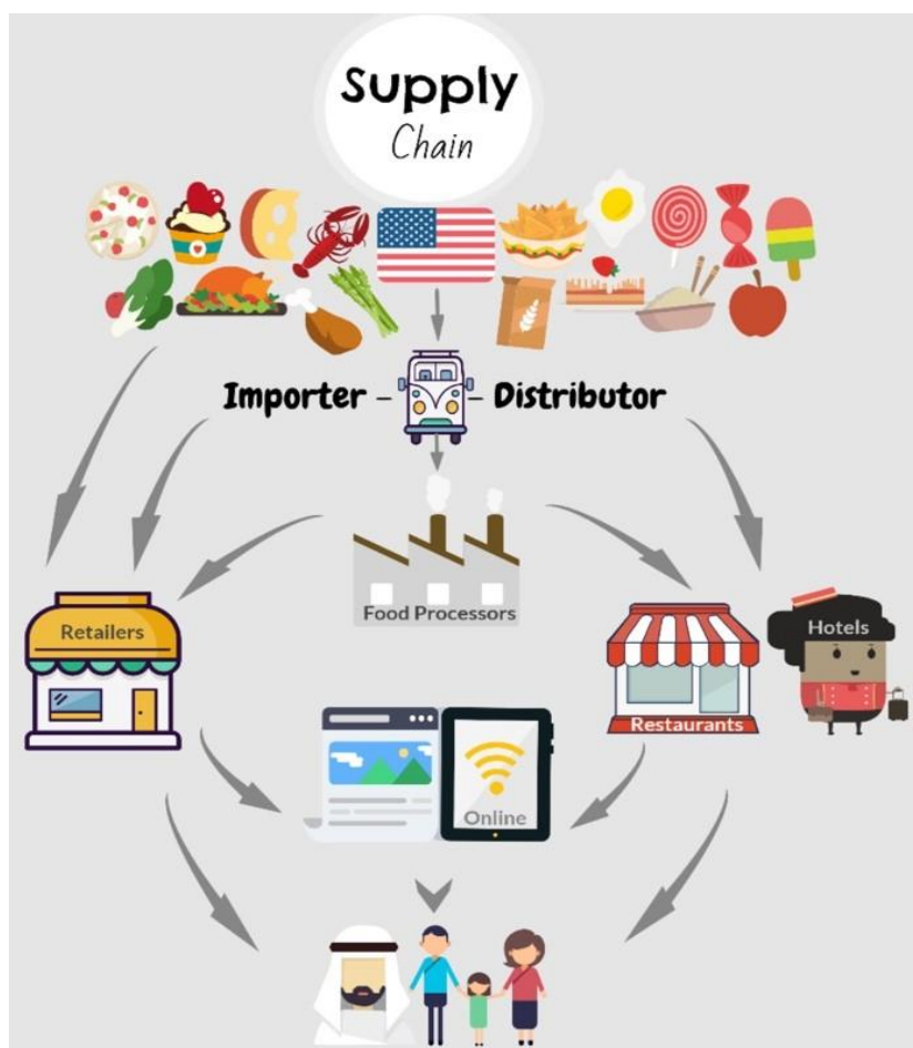
Figure 2: UAE Food Supply Chain

Because the UAE is dependent on agricultural imports it has an advanced supply chain that involves multiple layers. U.S. suppliers and manufacturers export products directly or through consolidators, products are then received by UAE importers, agents, or distributors for sale to retailers, food processor, hotels, or restaurants where they finally reach end-consumers. In recent years, major distributors have started selling directly to end consumers through online applications. The expansion of e-commerce has only accelerated due to COVID-19.